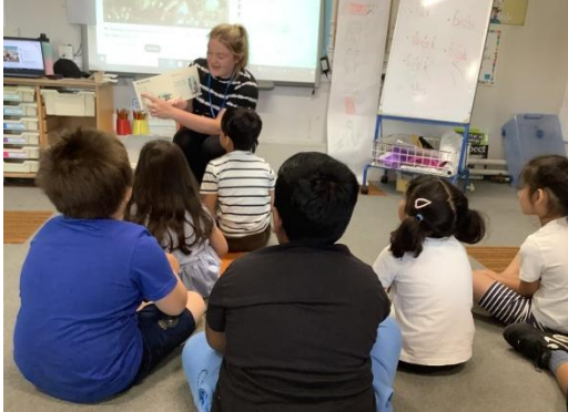
Whole class teaching