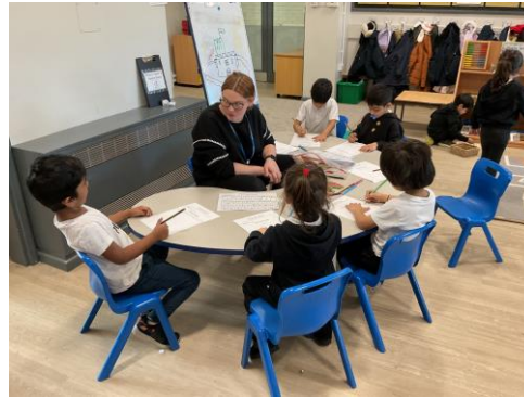
Adult led small groups