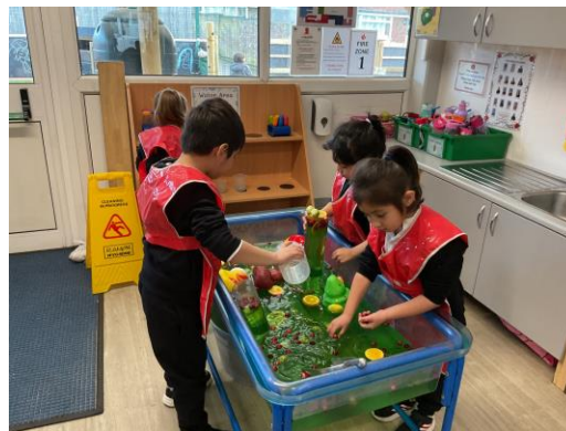
Choosing Time Indoors