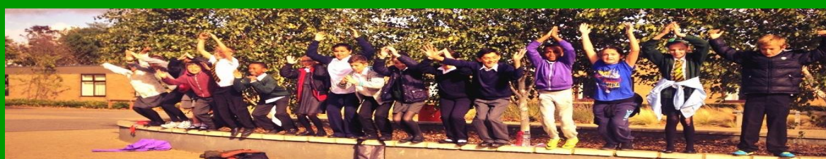
Pictured – Cluster Sports Partnership, Bronze Ambassadors 'YAing'!